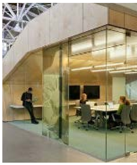
Meeting / studies area